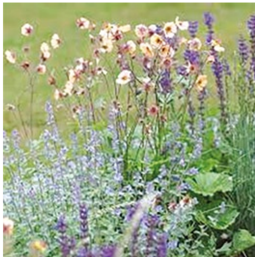
Plant of the Month: Geum Mai Tai